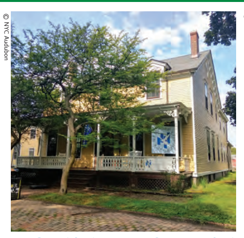
NYC Audubon's House on Governors Island, Nolan Park House #17

The house's front windows sported washable drawings of birds. This activity was great for two reasons: children loved drawing