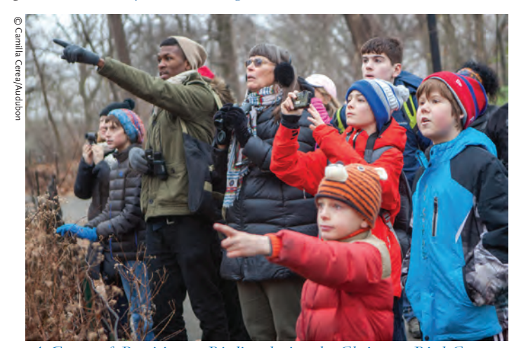
A Group of Participants Birding during the Christmas Bird Count in the Ramble, Central Park, December 14, 2014

Central Park is where the Christmas Bird Count originated in 1900, when ornithologist Frank Chapman proposed that the holiday tradition of competitive bird shooting be replaced by a bird census. Today, birders who regularly participate in the Central Park count may not realize there are 11 other count sectors in Manhattan. In fact, 21 of the 80 species sighted in the borough last year were found outside Central Park; large numbers of birds were seen in Inwood Hill Park, Riverside Park, and Randall's Island. Results for 2016 are posted at <u>www.nycaudubon.org/cbc</u>. Note that the official name of