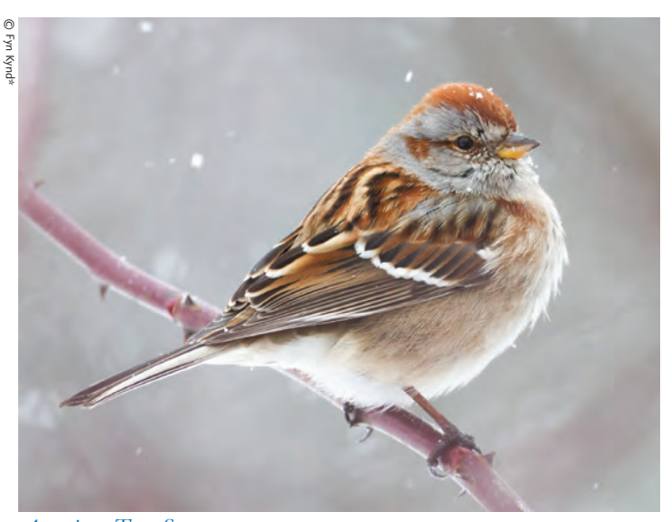
American Tree Sparrow

The Great Backyard Bird Count (GBBC) has a shorter history than the CBC, but is equally important for monitoring bird populations. Begun in 1998 as a joint effort of National Audubon, the Cornell Lab of Ornithology, and Bird Studies Canada, the goal of the GBBC is to capture a snapshot of bird numbers in a short period of time. Citizen scientists are asked every February to spend at least 15 minutes counting birds in their backyards—or anywhere else. (New Yorkers without backyards are not excused.) Submit a separate checklist for each new day and location, or the same location if you counted at a different time of day. With eBird, it's easier than ever to submit your data. The 21st annual GBBC takes place from Friday, February 16 to Monday, February 19, 2018. For more information, go to <u>gbbc.birdcount.org</u>.