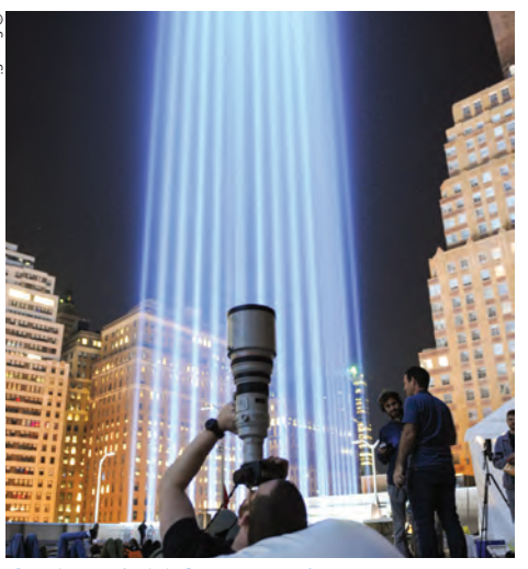
Studying the Tribute in Light, 2017

This year's Tribute in Light coincided with the publication of a study born out of our many years of work monitoring the annual light display. The study, published this September in the Proceedings of the National Academy of Sciences , analyzes seven years of