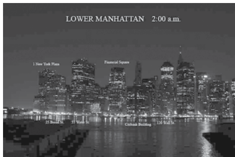
City lights attract birds – sometimes with deadly results. Working with the City and other real estate partners, NYC Audubon launched Lights Out NY. Buildings in the program committed to turning off their lights at midnight during the peak of spring and fall migration. Lights Out NY reduced bird collisions and energy bills for building owners.