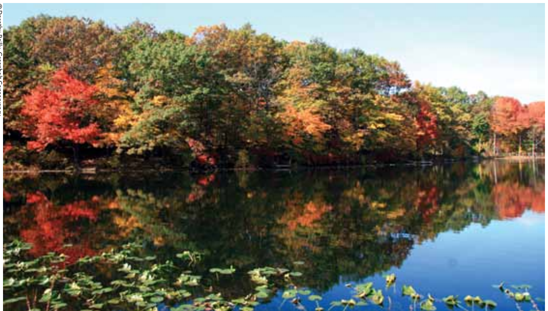
Pouch Camp, Staten Island, New York

A dvocating for conservation of the natural environment against competing interests is one of the ways that NYC Audubon pursues its mission. That is why we have joined 29 other organizations in supporting Staten Island's Committee to Save Pouch Camp.