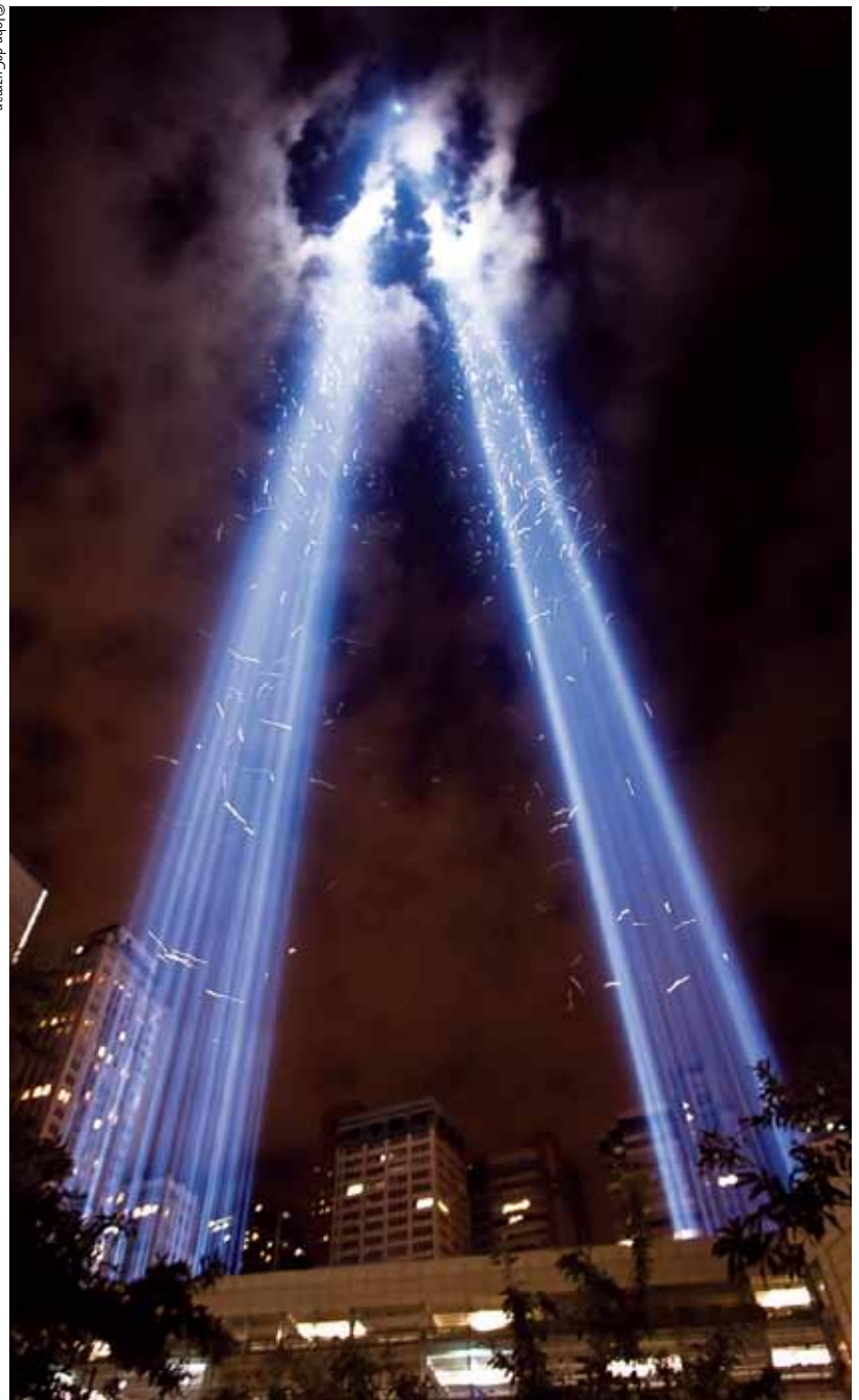
Birds Caught in the 2010 Tribute in Light Memorial