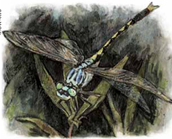
Unicorn Clubtail Dragonfly

with several parties, including city, state, and federal officials, hoping to put together