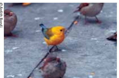
Waiting to Be Fed