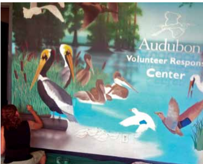
Painting the Wall Mural at Moss Point, Mississippi